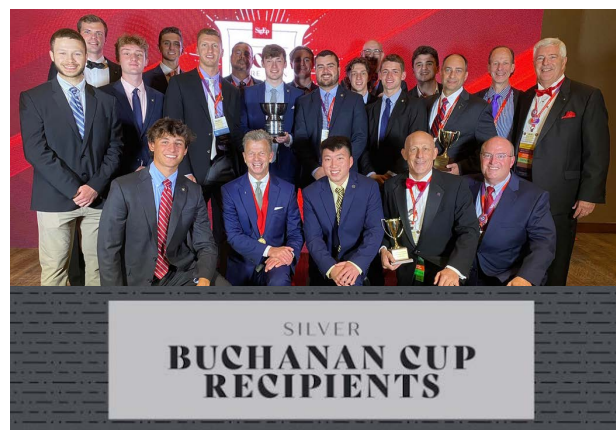
Our brothers represent Connecticut Alpha at the Denver Conclave in 2021.