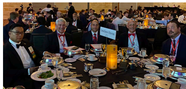
The Conclave Chorus at the formal dinner.