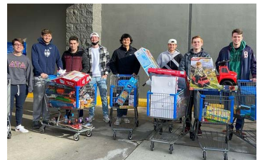
SigEp members dedicate their time to philanthropy, raising $2,400 for Toys for Tots.