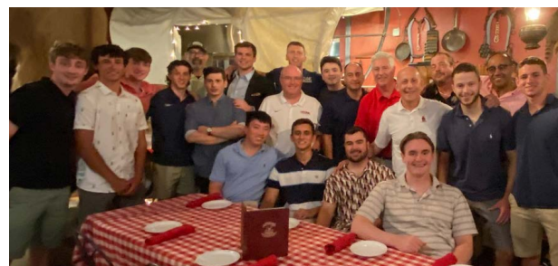
Brothers enjoy sharing a meal at the Buckhorn Exchange in Denver on Friday night.