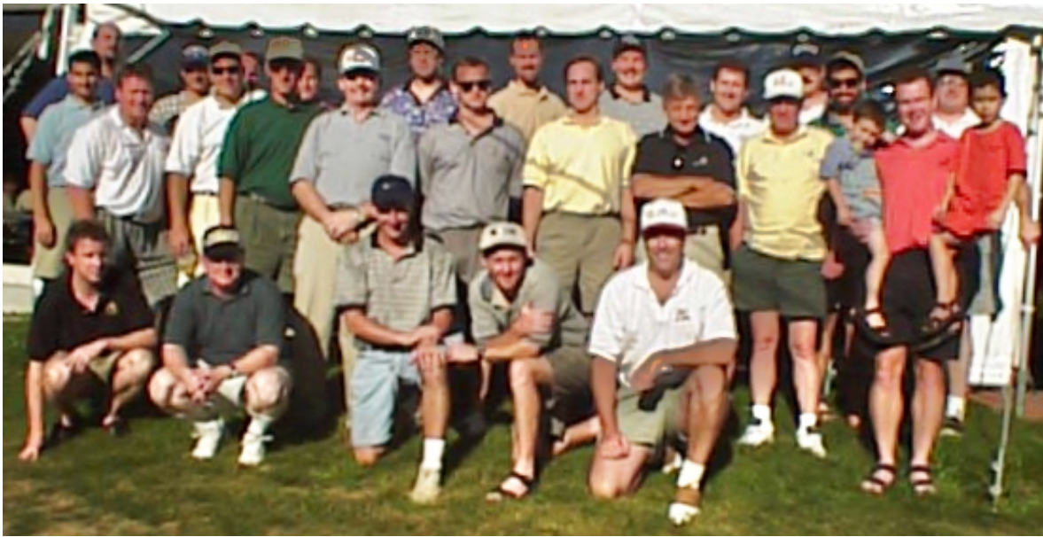
The 1998 SigEp golf tourney participants.