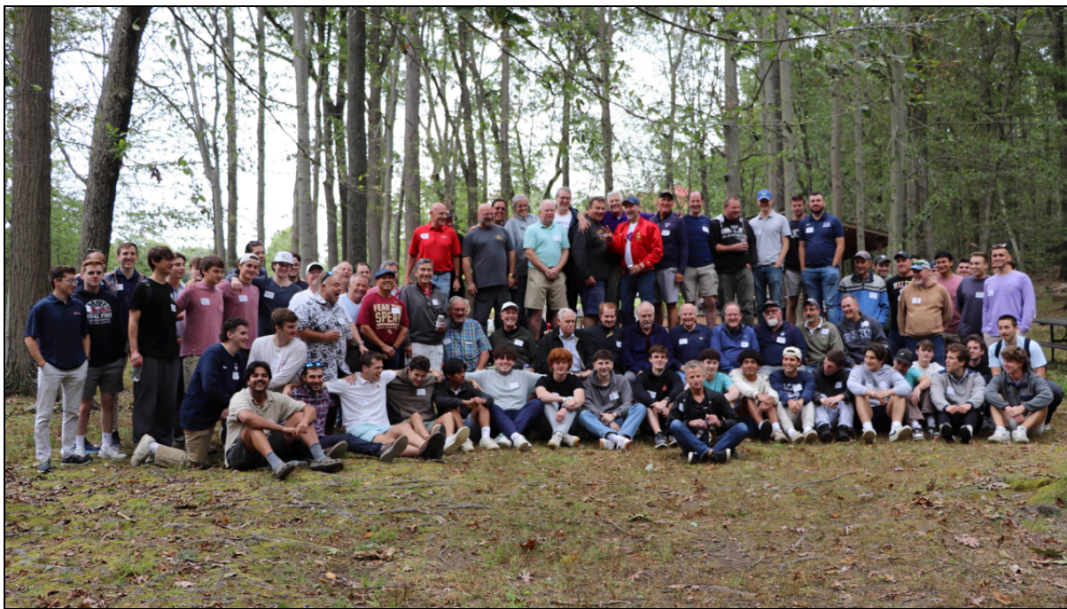
Over 100 alumni and undergraduate brothers gathered in Manchester, CT in September for the CT-A Biennial Reunion Picnic.