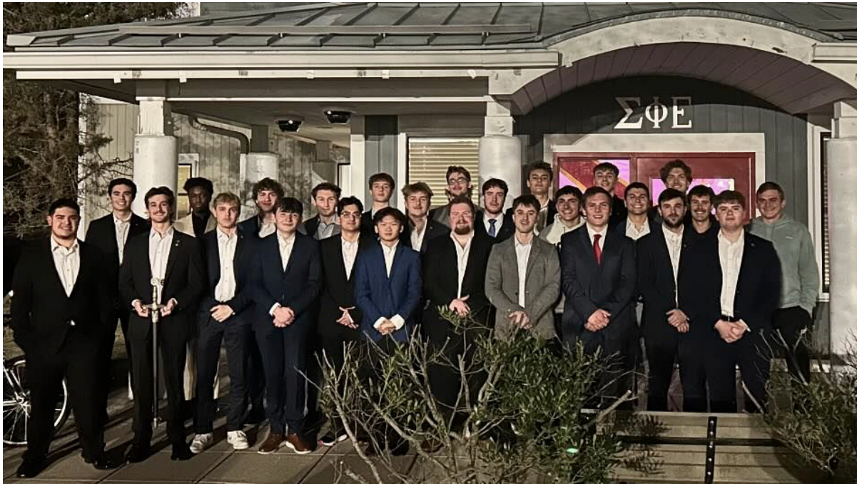
Quinnipiac brothers gathered in front of the Ed Kaplan Chapter House in Husky Village following the Ritual ceremony.

help launch reestablished Connecticut Epsilon chapter by conducting Ritual initiation ceremony for 27 execute and standards board officers. Read more here .