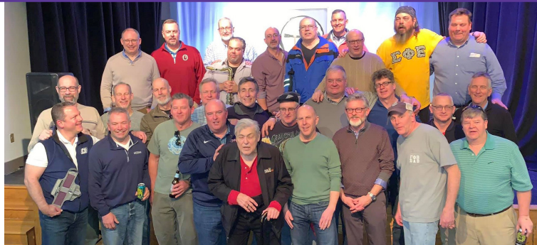
CT Alpha sings the Anthem